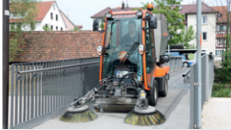
X 45i with sweeping-suction combination