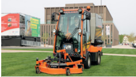
X 45i with mowing-suction combination