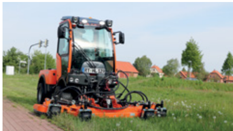
C series with large-area mower