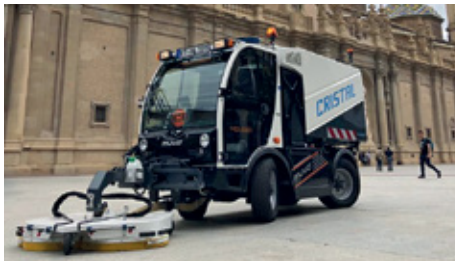
MUVO with high pressure cleaning system