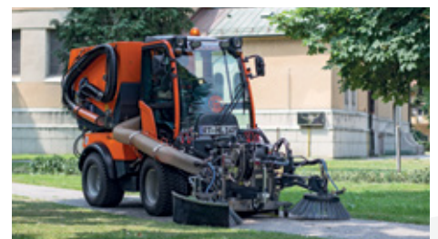
C series with sweeping-suction combination