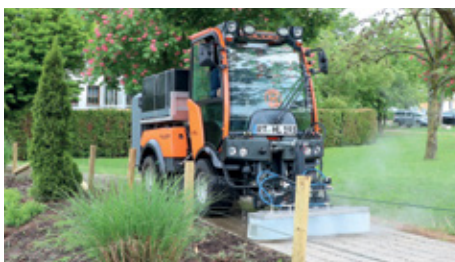
C series with hot water weed control