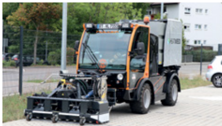
MUVO with hot water weed control