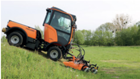
C series with large-area mower