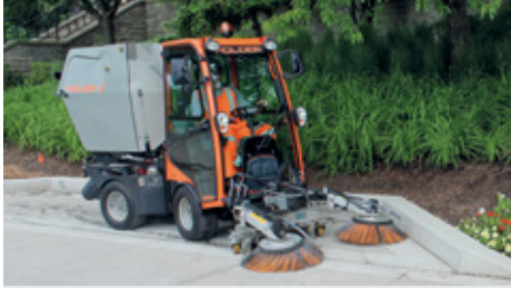
X 45i with sweeping-suction combination