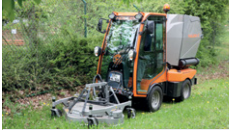
X 45i with mowing-suction combination