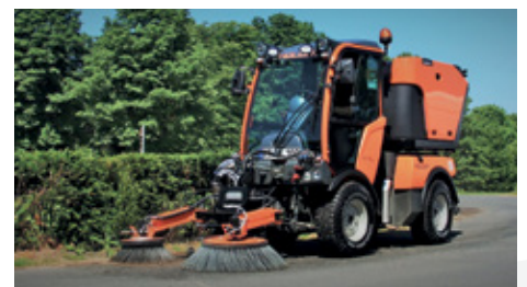
C series with sweeping-suction combination