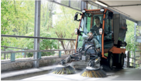
X 45i with sweeping-suction combination