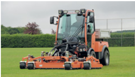
B series with large-area mower