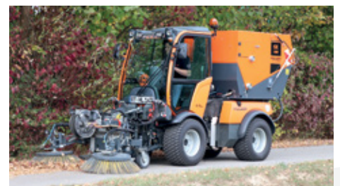
C series with sweeping-suction combination