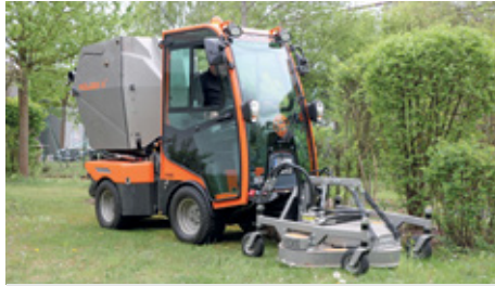
X 45i with mowing-suction combination