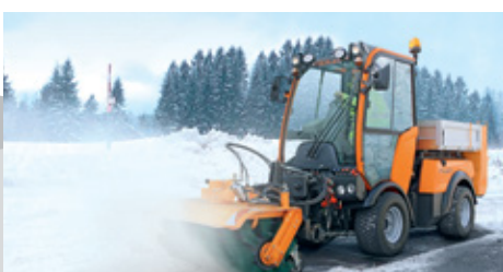
B series with front sweeping brush and roller combi spreader