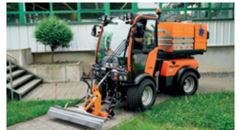
C series with washing bar and watertank