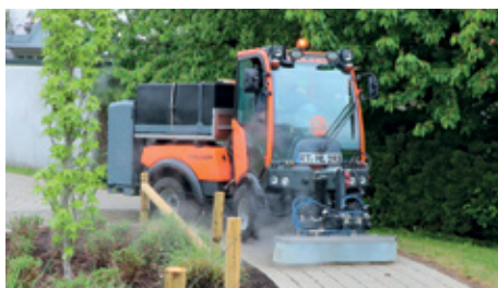
C series with hot water weed control