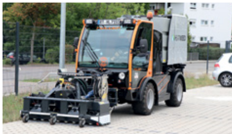
MUVO with hot water weed control