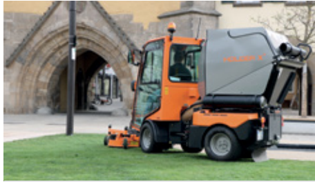
X 45i with mowing-suction combination