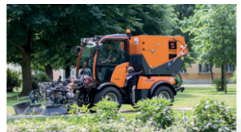
C series with sweeping-suction combination