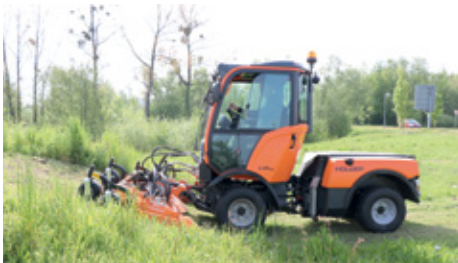
C series with large-area mower