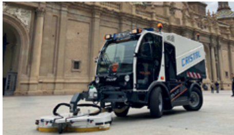
MUVO with high pressure cleaning system