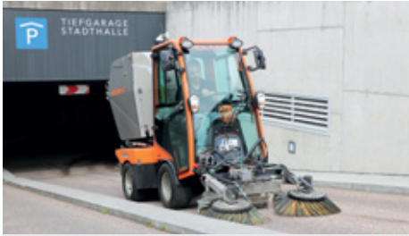
X 45i with sweeping-suction combination