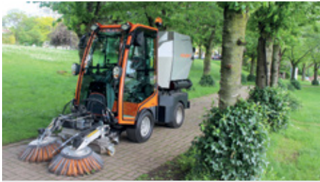
X 45i with sweeping-suction combination