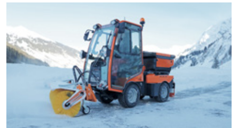
X 45i with front sweeping brush and spreader