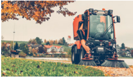
C series with mowing-suction combination