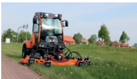
C series mit large-area mower