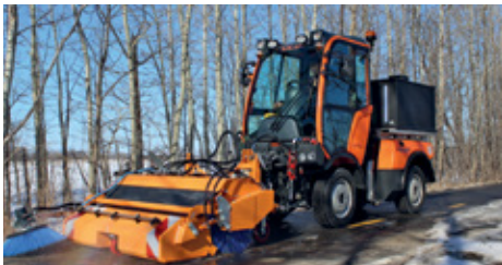
C series with pickup-sweeper and liquid salt system