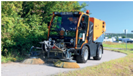
MUVO with mowing-suction combination