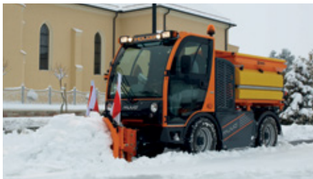
MUVO with plough and spreader