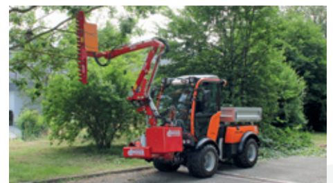
C series with heach cutter